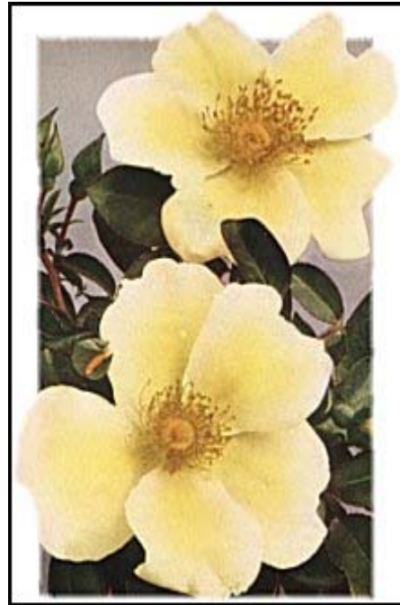
'Mermaid' (Hb) reproduced from McFarland